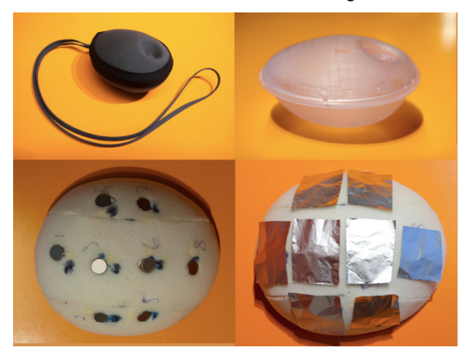
Figure 2. An assembled Lega, the inner shell, vibrator placement, and touch sensor placement.

The top part houses a servo-powered button that is used to alter the depth of the indentation on top of the device. Through a simple modification we were able to read the state of the servo's internal potentiometer thereby enabling it to also function as a sensor, telling us when the button was pushed. A single layer of cloth to create a seamless appearance covers the whole top, including the button. In addition the thin cloth layer allows light from the multi colored LEDs inside the device to shine through.